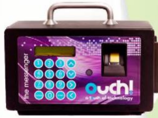
the messenger portable