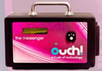
the messenger portable-i